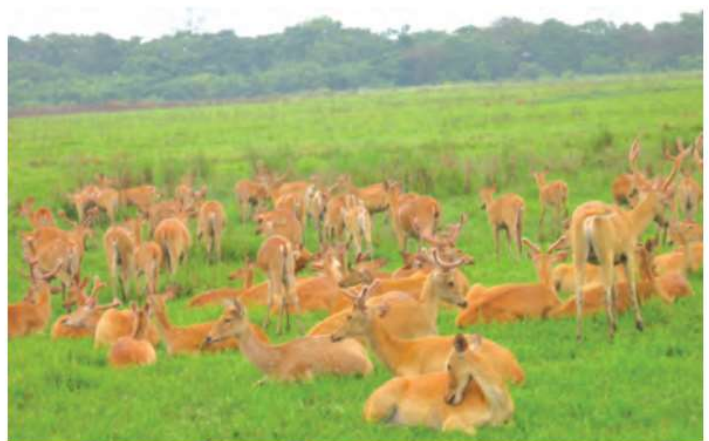
Rhino and deer in Kaziranga National Park